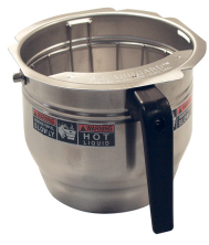
FUNNEL AY,W/DECAL GRT "C"7.12