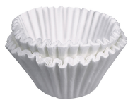
FILTERS,REGULAR1M 500/2 50/CL