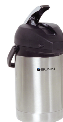
AIRPOT, 2.5L SST LA SINGLE PK