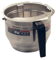
FUNNEL AY,W/DECAL GRT "C"7.62