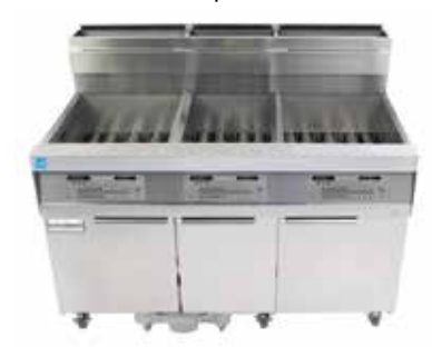
Model Shown: 11814/HD50G/11814