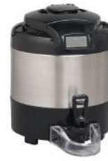
TF SERVER, DSG2 1G SST NOBASE