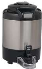
TF SERVER, DSG2 1.5G SST NOBAS