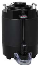
TF SERVER, 1.5G/5.7L MECH BLK NOBASE