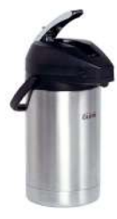
AIRPOT, 3.0L SST LA 6/ CASE