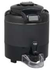
TF SERVER, DSG2 1G BLK NOBASE