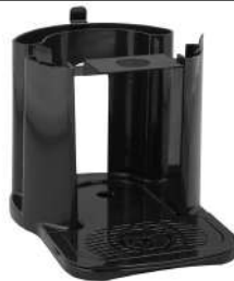
STAND ASSY, TF SERVER