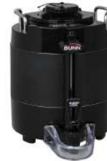
TF SERVER, 1G/3.8L MECH BLK NOBASE