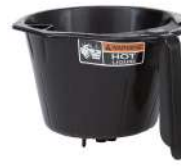
FUNNEL ASSY, SMART COFFEE BLK-CLEARED