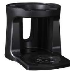
STAND ASSY KIT, TF SERVER