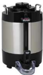
TF SERVER, 1.5G/5.7L MECH NOBASE