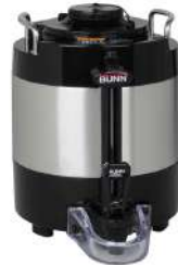
TF SERVER, 1G/3.8L MECH NOBASE