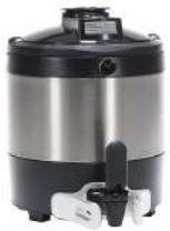
TF SERVER, 1G DSG GEN3 NOBASE