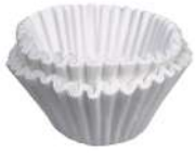
FILTERS, GOURMET 500 500/1 50/CL