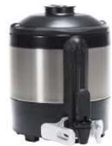
TF SERVER, 1G MECH GEN3 NOBASE