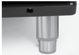
Adjustable legs (from 101-152mm) available with optional leg kit K-00345.