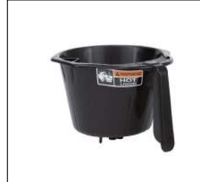
FUNNEL ASSY, SMART COFFEE BLK-CLEARED