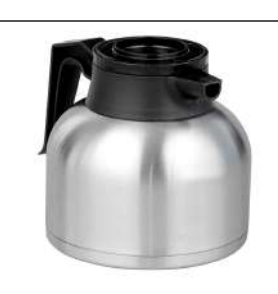
CARAFE,SST 1.9L SHRT BLK 1