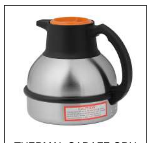
THERMAL CARAFE,ORN 1.9L 1PK