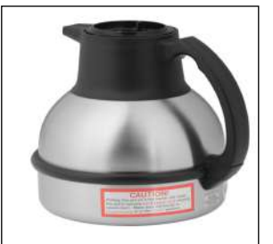
THERMAL CARAFE, BLK 1.83 L 1PK