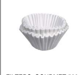
FILTERS, GOURMET 500 500/1 50/CL