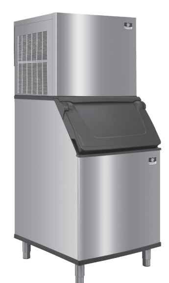
RNF-1100A Nugget Ice Machine on D-570 Bin