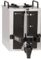
1.5GPR-FF, TOP HNDL