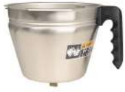
FUNNEL ASSY, W/ INSERTS SMTF