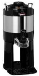
TF SERVER, 1G/3.8L MECH