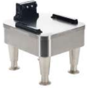
1SH STAND, CE 220-240V INF SERIES