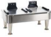
2SH STAND, CE 220-240V INF SERIES