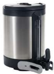
SH SERVER, 1.5G/5.7L INF SERIES