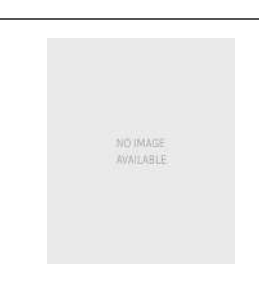
AIRPOT, 2.2L GL PB 6/ CASE